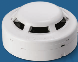
QA01 Addressable Photoelectric Smoke Detector