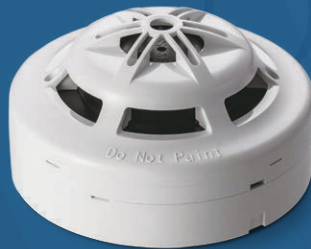
QA05 Addressable Combination Smoke & Heat Detector