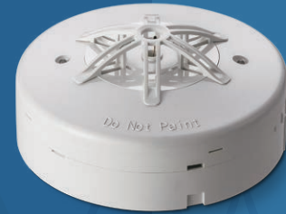
QA06 Addressable Heat Detector